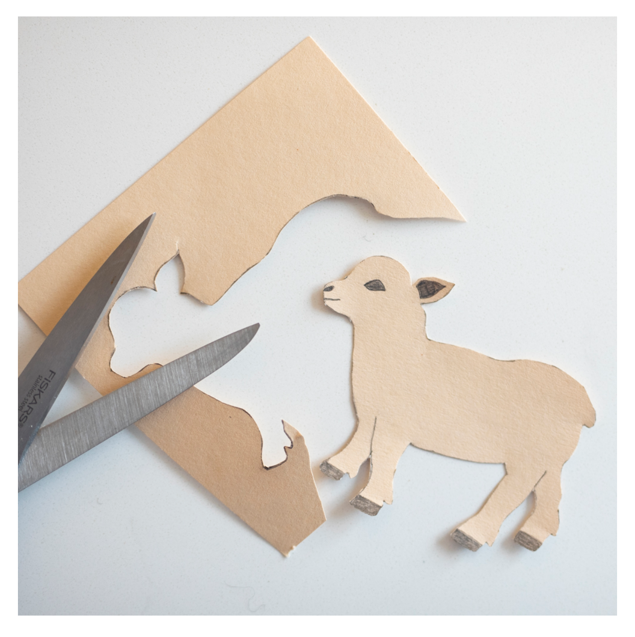
3) Use your template to draw 6 lambs in the colour mix you want: