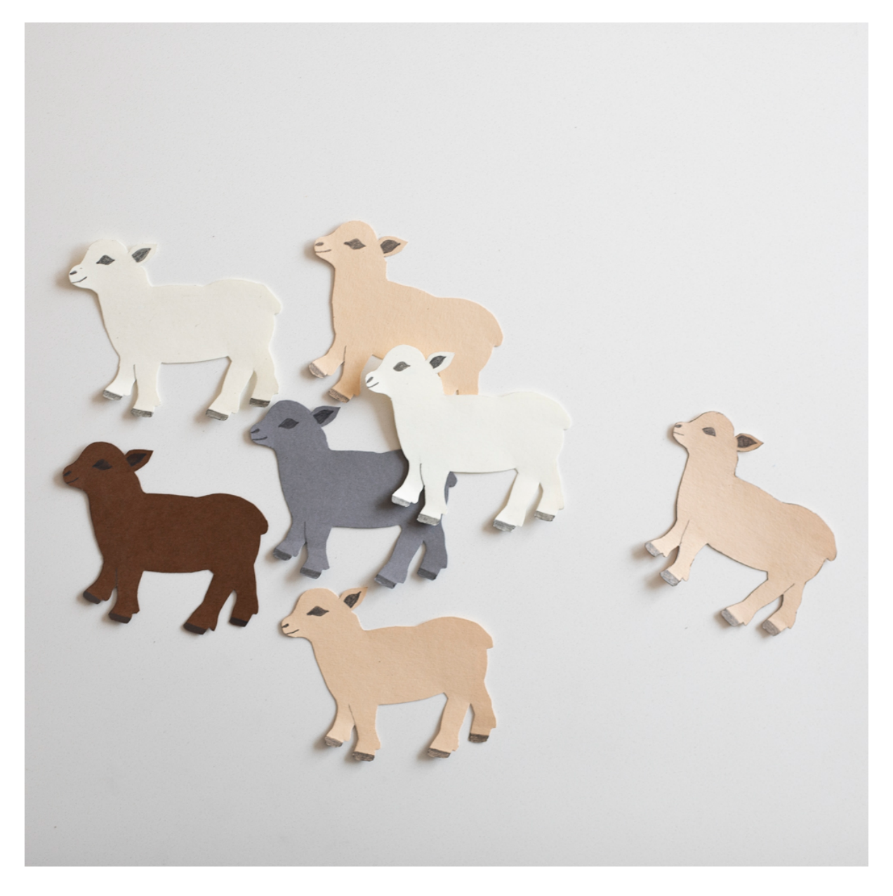
5) Take one lamb and the colour of yarn you think best suits it. Tie one end of the yarn around the lamb: