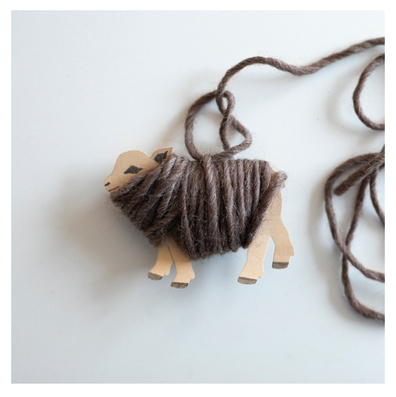
8) Put a needle on your yarn end and stick the needle through 1 felt ball in your desired color: