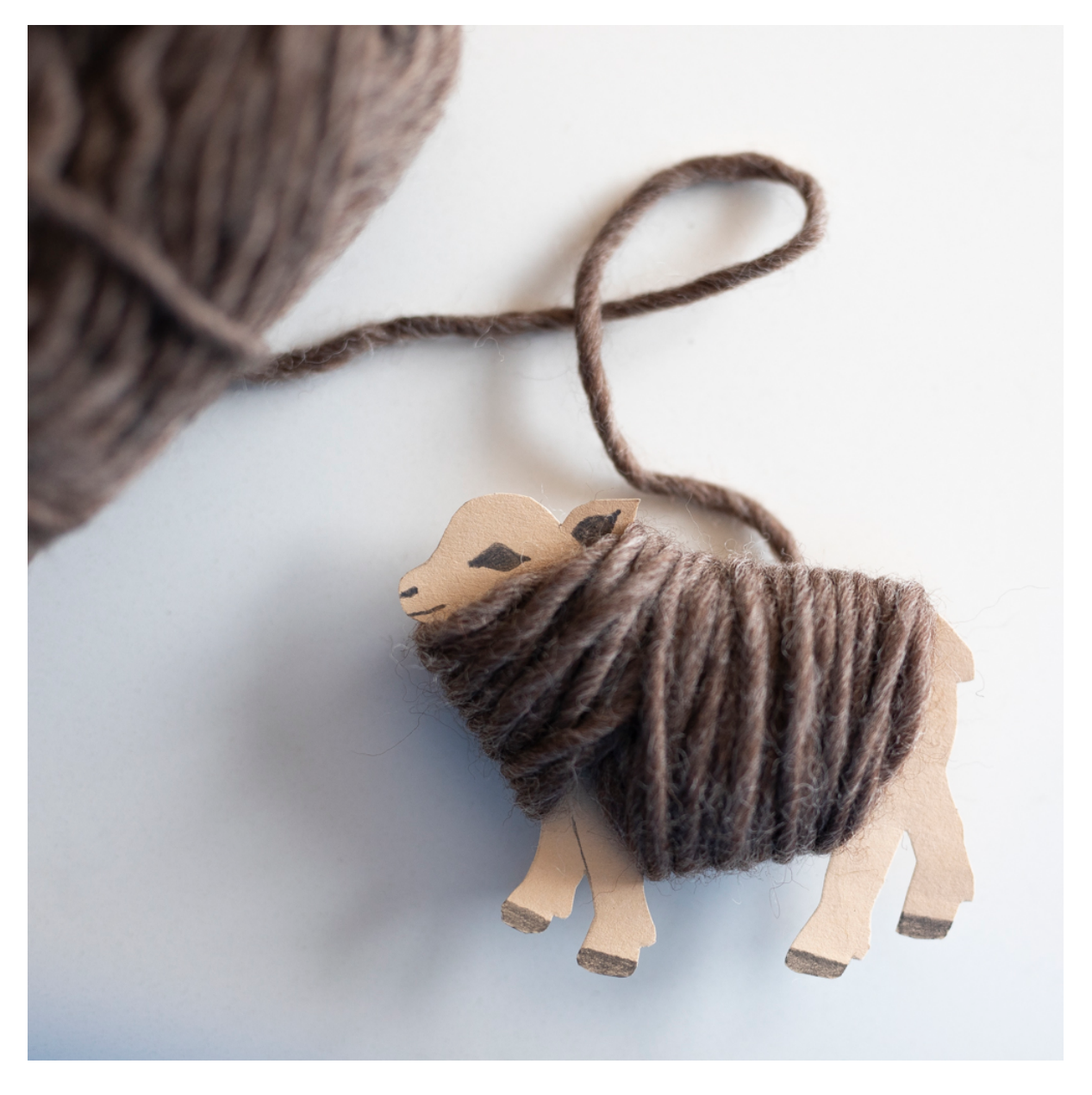
7) Fasten the string by tying a knot on the back of the lamb. Check if the lamb hangs straight when it is placed: