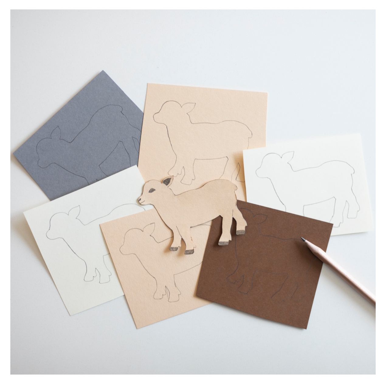
4) Cut out your 6 lambs. Erase any remaining pencil lines that you have cut: