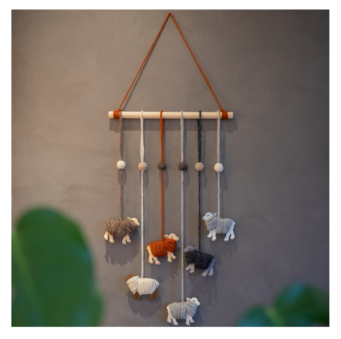
15) You can also choose to hang your 6 lambs on the ornament instead. If necessary, adjust the length of the strings again to fit. If the project will be used as a gift, you can buy a nice piece of <u>fabric</u> and sew a reusable gift bag for the ornament: