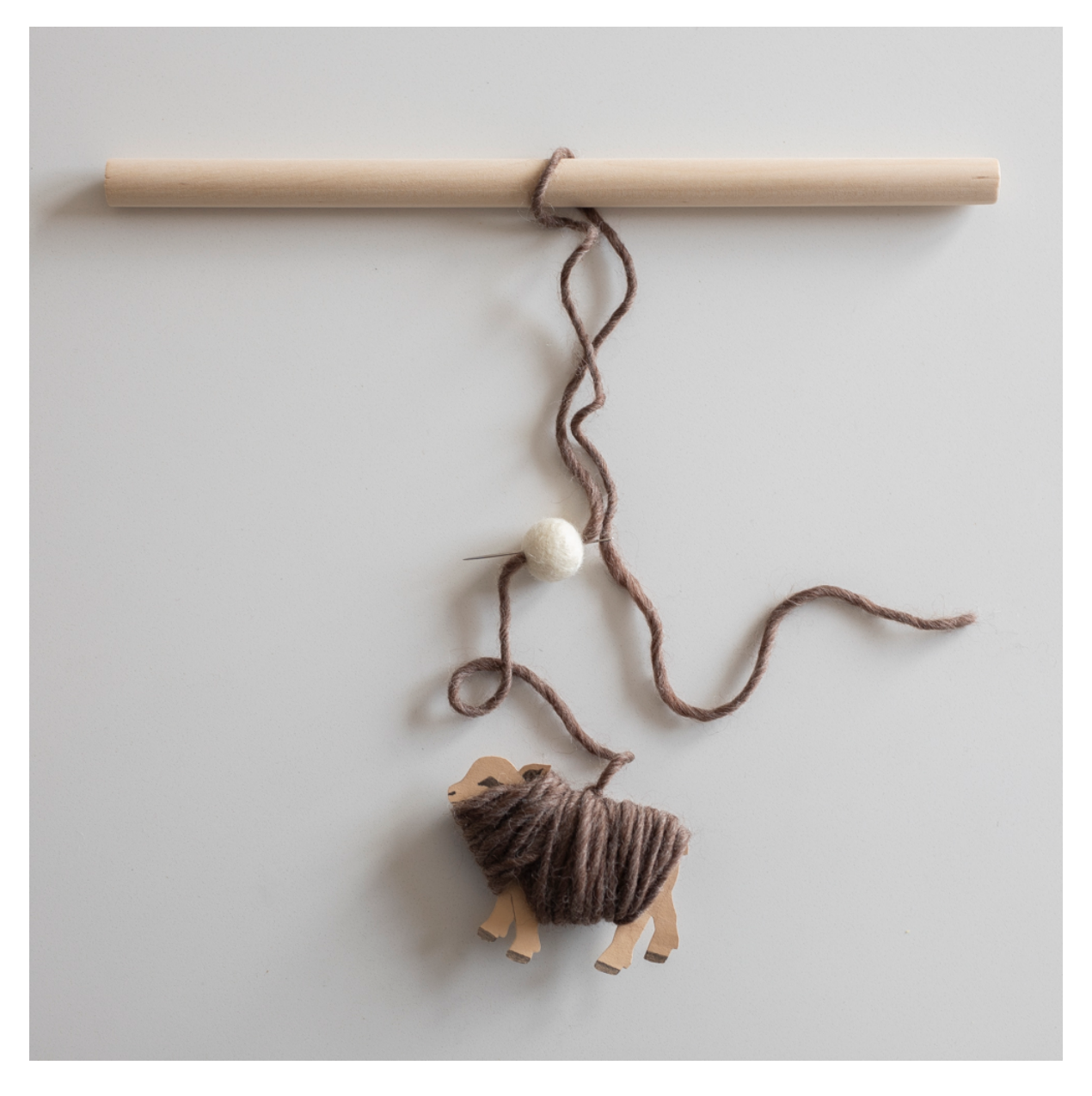
10) Make 5 more lambs in the same way. Combine the colours of the cardboard, yarn and felt balls as you like!