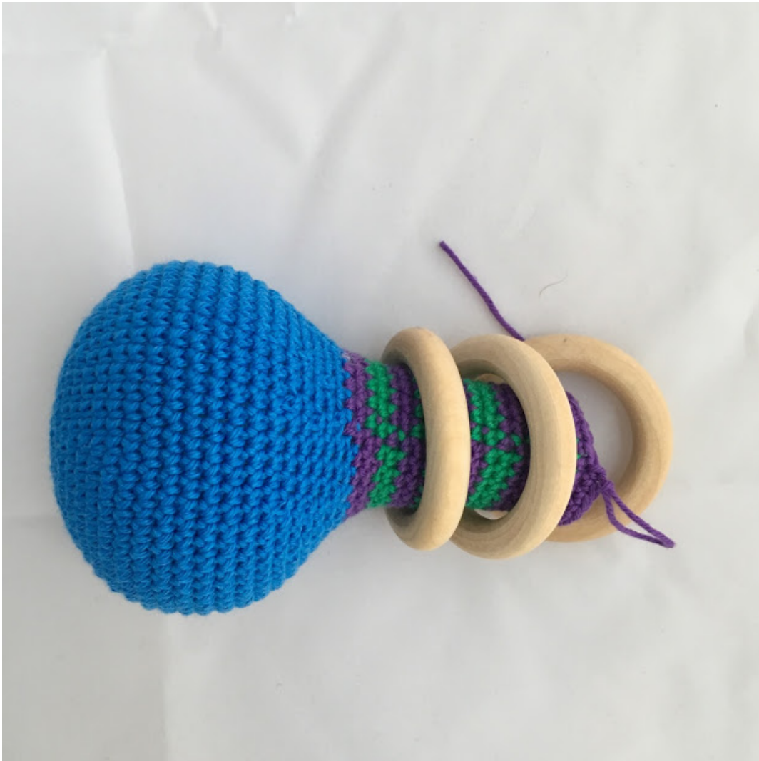
Photo guide: Once you have cut the purple strand, you put the wooden rings on the neck before switching to the red yarn and crocheting the body.

Now cut the purple strand, leaving a long tail so you can add the three wooden rings around the neck.